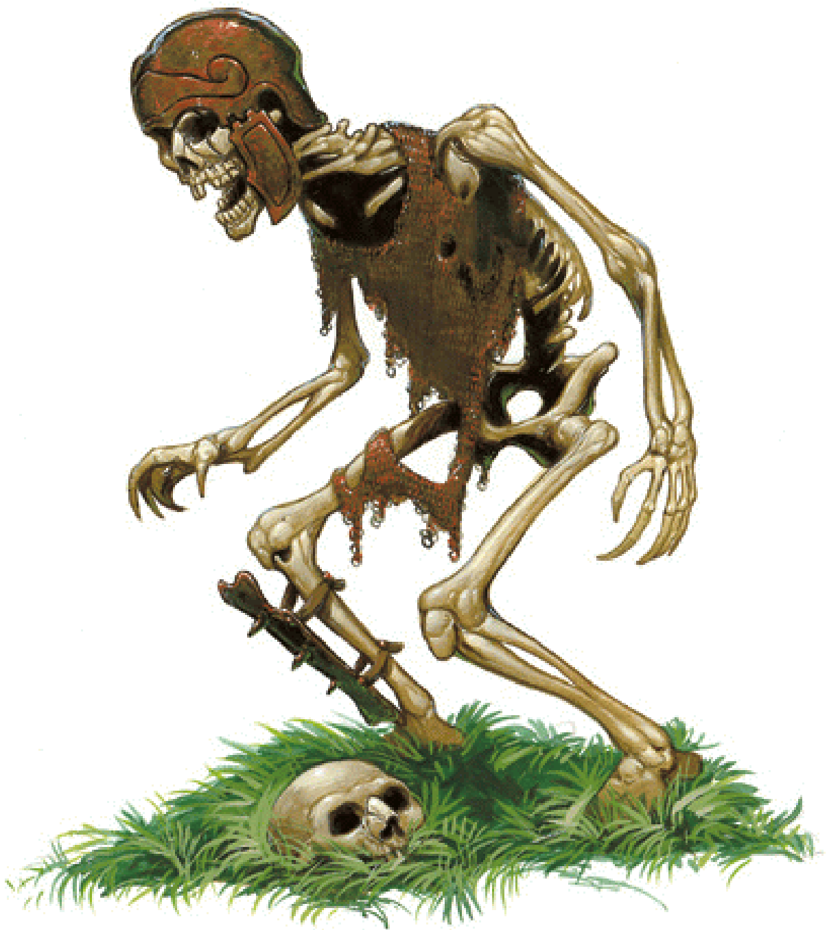
Visual Aid. Skeleton (Area 43).