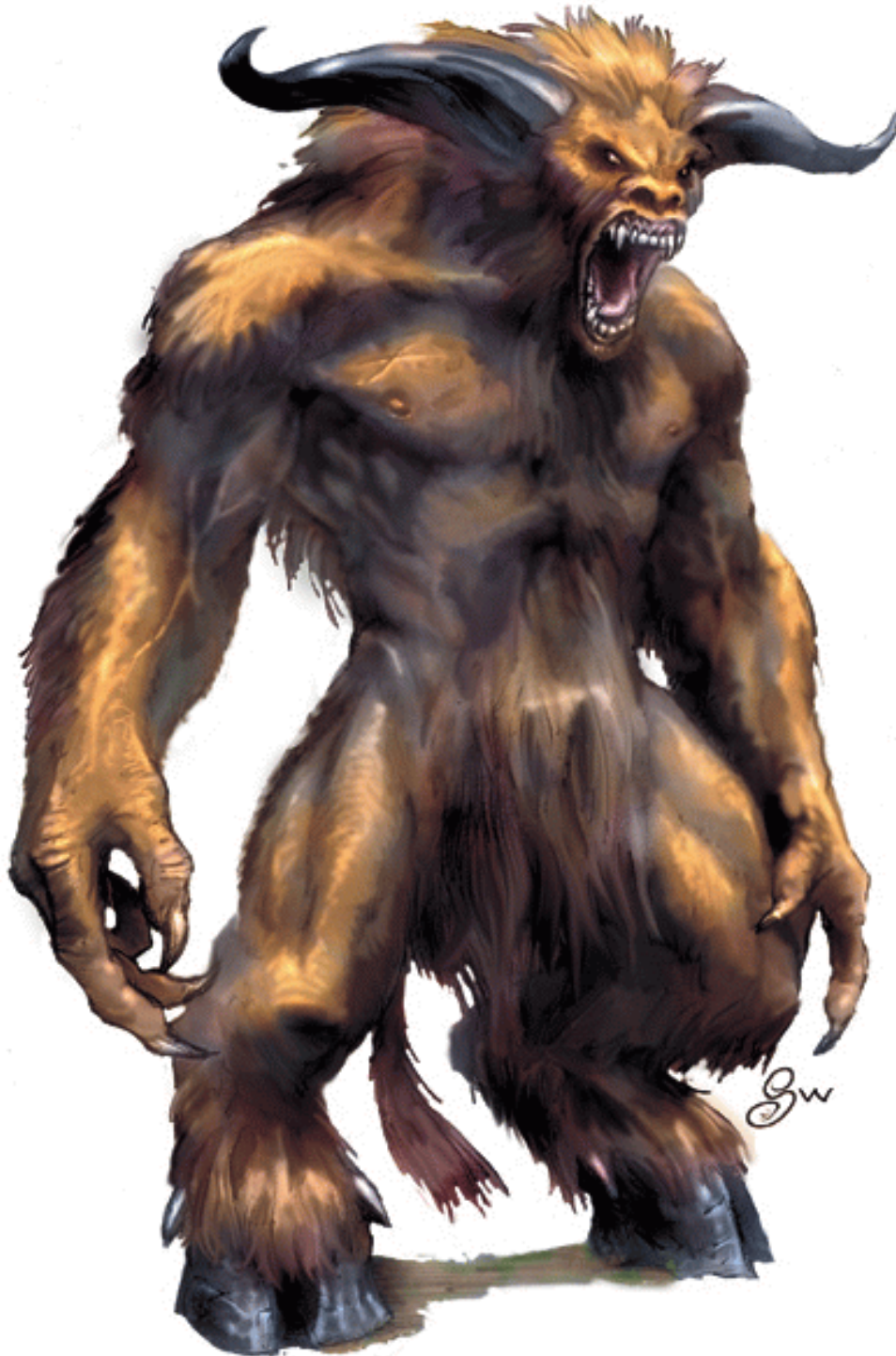
Visual Aid. Minotaur (Area 20).