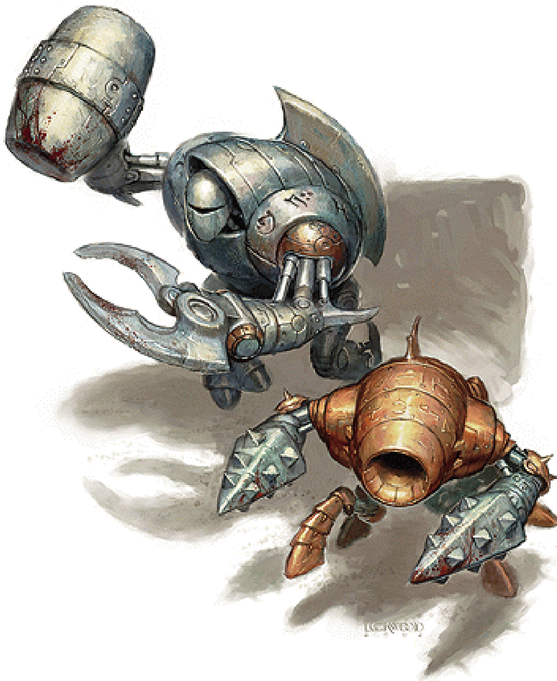
Visual Aid. Pulverizer (Area 8).