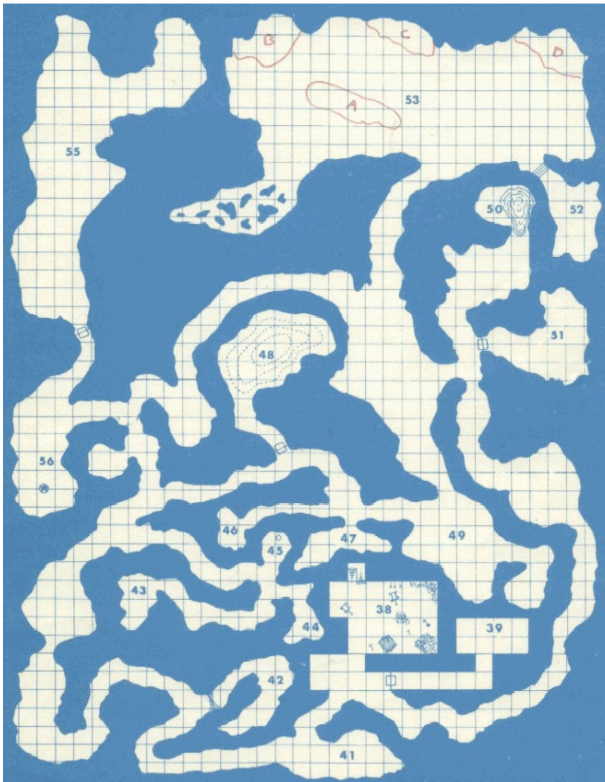
Visual Aid. Cavern Level Player's Map.