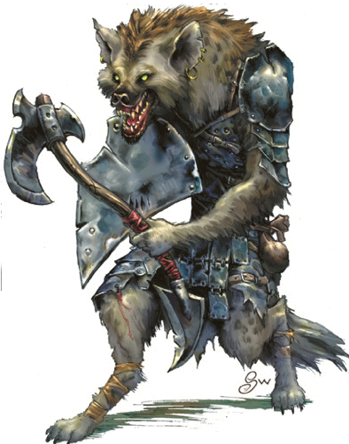
Visual Aid. Gnoll (Area 2).