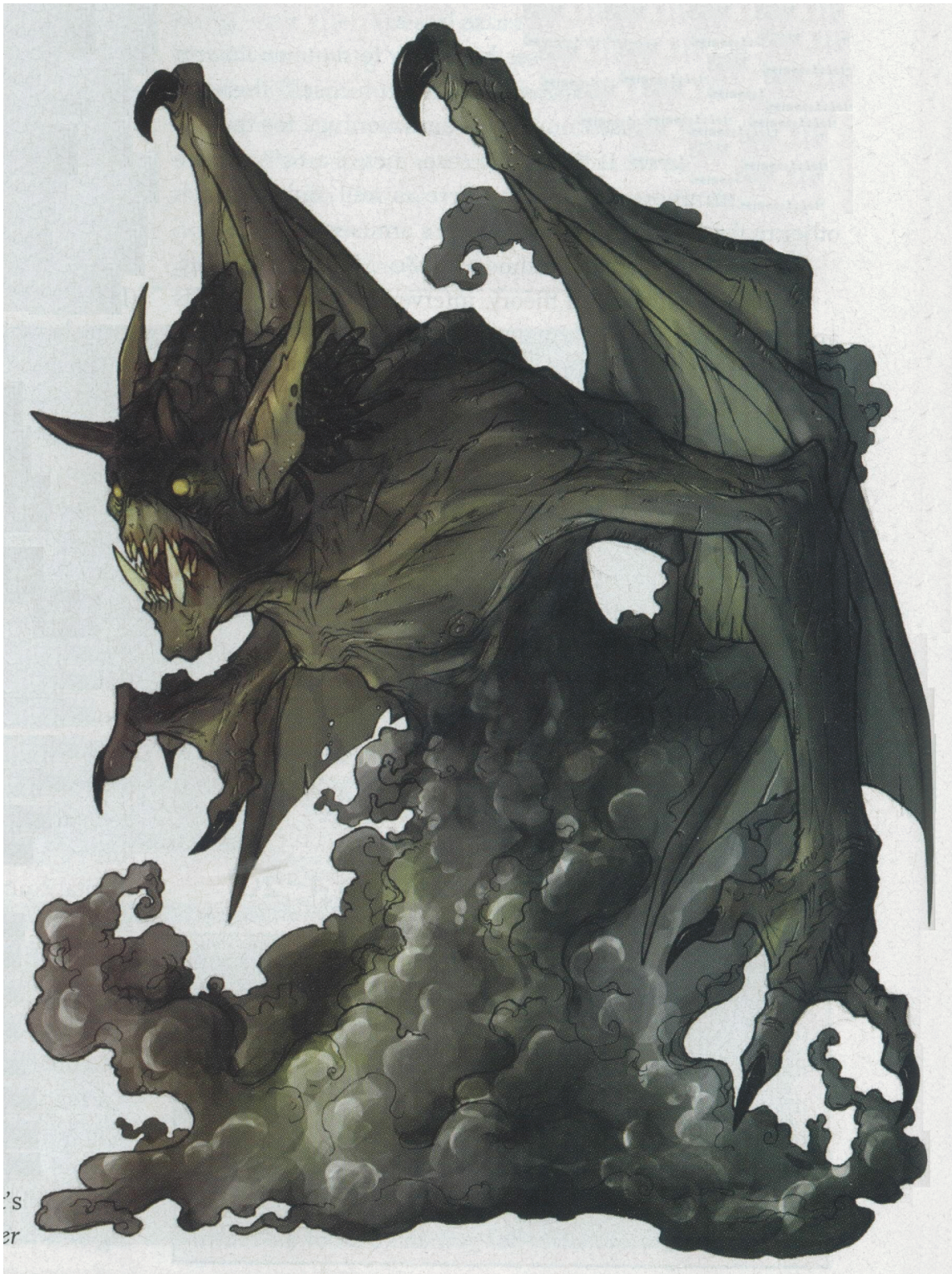
Visual Aid. The Demon (Cavern 55).