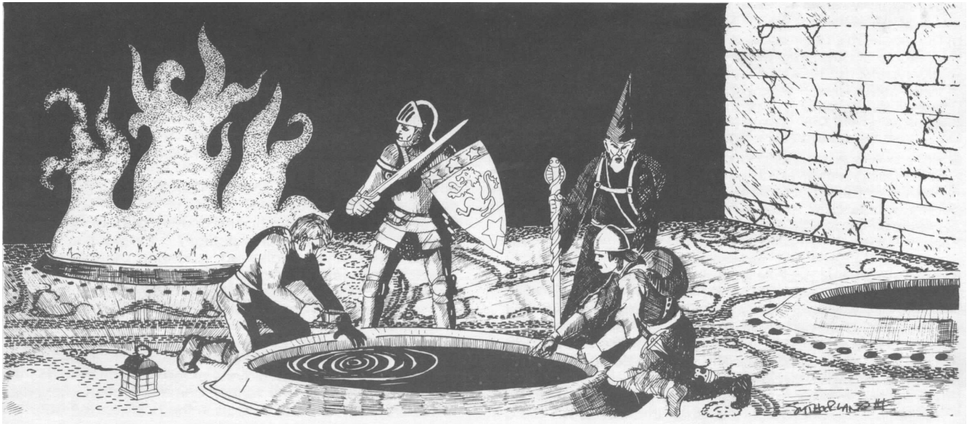
Visual Aid. Room of Pools (Area 31)