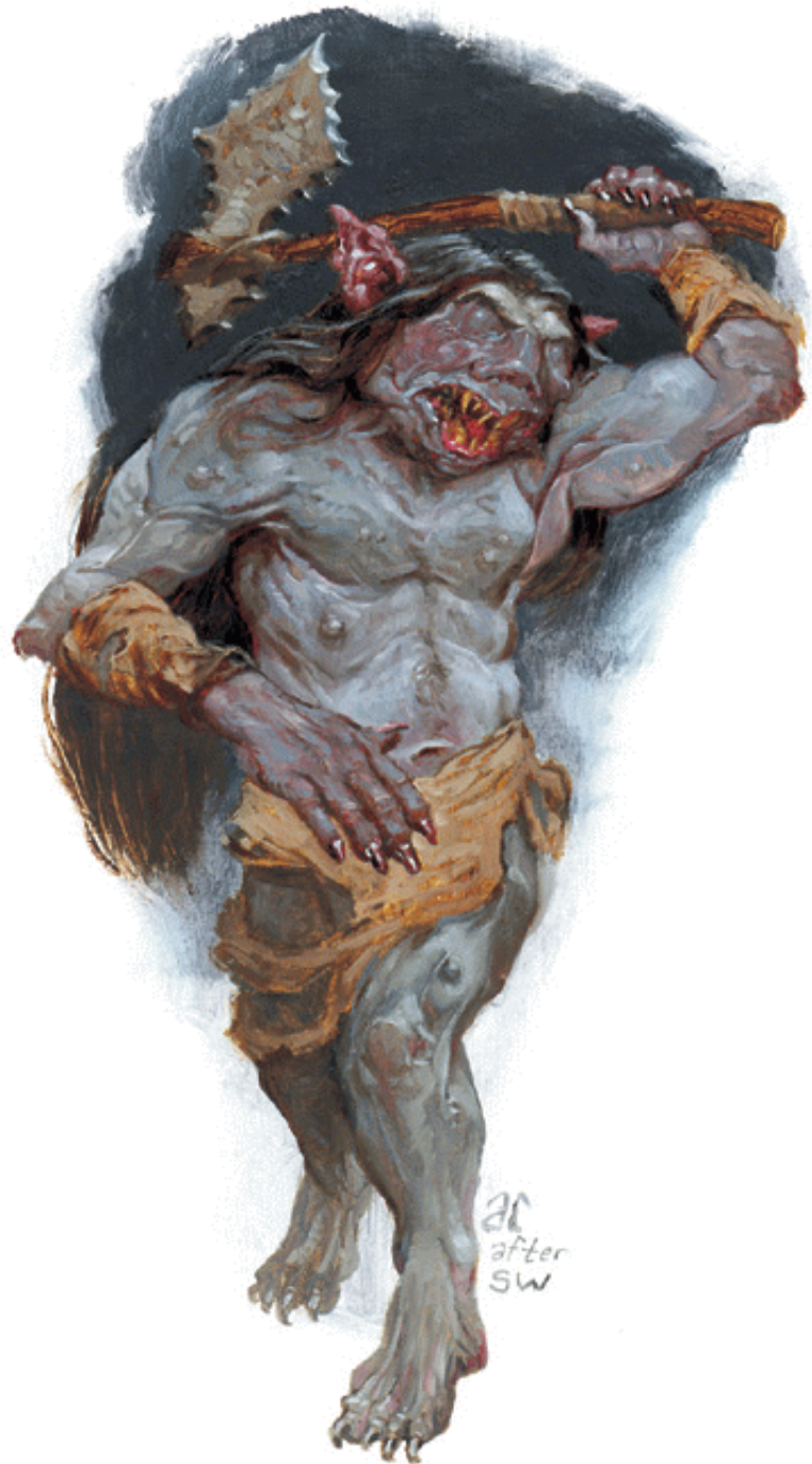
Visual Aid. Grimlock (Area 18).