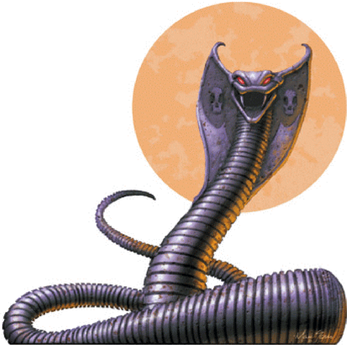
Visual Aid. Iron Cobra (Area 24).