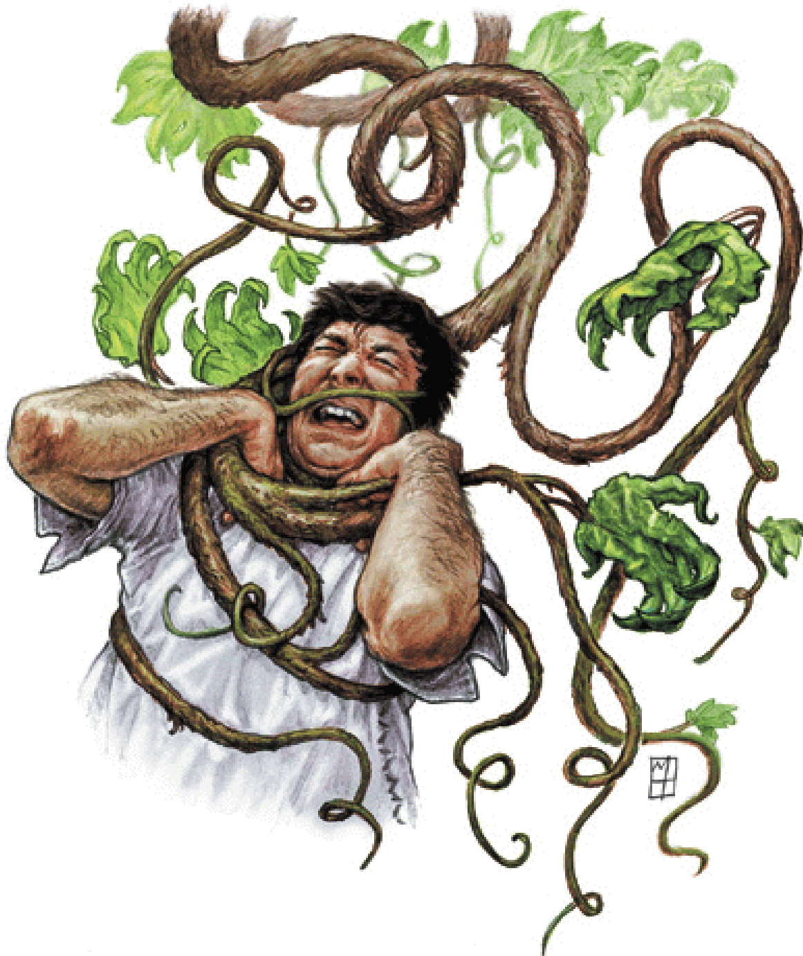
Visual Aid. Assassin Vine (Area 1).