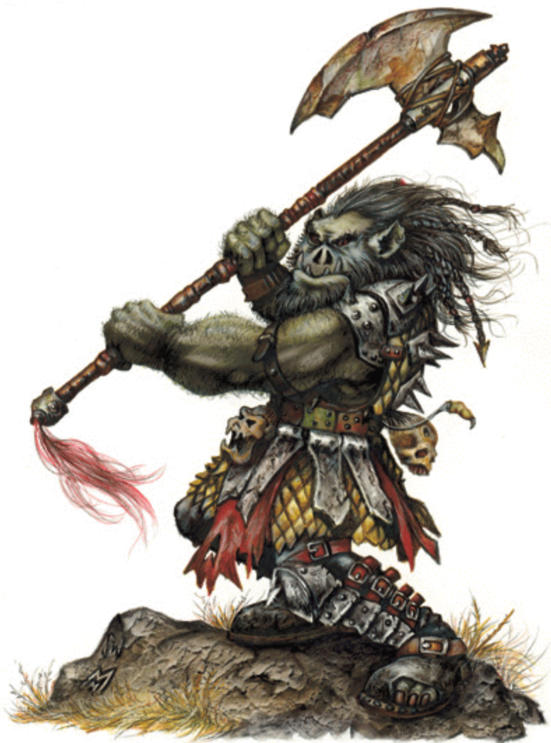
Visual Aid. Orc (Area 5).